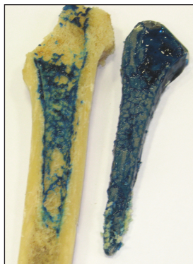
The femur was cut with an oscillating saw to show the hydrogel coating along the entire prosthetic stem and adjacent bone.