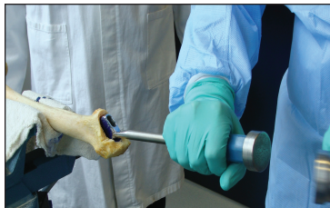
Pictured is a hydrogel-coated prosthesis inserted in a human femur.