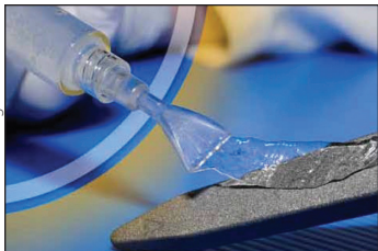
DAC hydrogel is spread onto an uncemented, sand-blasted titanium prosthesis with a syringe spreader.